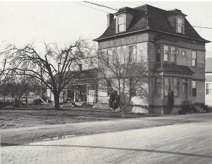
D. O. Pearson House photographed in 1969. Note the brick street, the pears tree, open back porch and front steps.

It was a decade later, in 2000, when the historic I.O.O.F Hall and Tolin House next door became available for sale. The Odd Fellows Hall (IOOF) was historic as well and the Tolin house (now business office) was the home of early