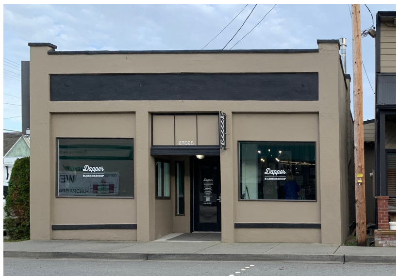
Dapper Barber Shop in the former Twin City Dairy.